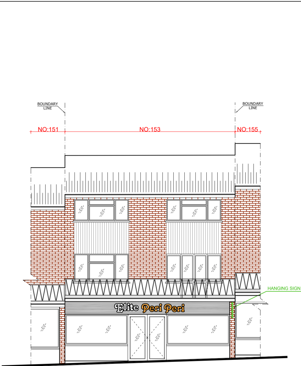
PROPOSED FRONT ELEVATION SCALE: 1/100 @A3